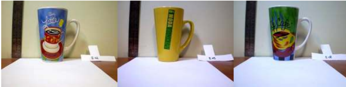
Figure 3: The frustum group artefacts E-02, E-05, E-08 http://dollarware.org/e-02.jpg http://dollarware.org/e-05.jpg http://dollarware.org/e-08.jpg

The third cluster is the rounded. Like the frustum, rounded cups are determinable by the top-base ratio, however, unlike the frustum where the sides of the vessels are always straight, these vessels expand outwards in a bowl-like shape, often with higher ratios than that of the frustum due to the nature of the rounded bottom. From the chart, there is no majority cluster for this group; in fact, it is hard to differentiate just by looking at the plots. Therefore, I have chosen an outlier that qualifies in the rounded shape and differs from the frustum and cylindrical groups in terms of top-base ratio and height. Artefacts A-09, C-02, C-04 (average top-base ratio is 1.765, average height is 74.9), make up the rounded group (see figure 4).