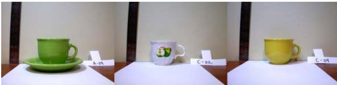
Figure 4: The rounded group artefacts A-09, C-02, C-04 http://dollarware.org/a-09.jpg http://dollarware.org/c-02.jpg http://dollarware.org/c-04.jpg

The third cluster is the rounded. Like the frustum, rounded cups are determinable by the top-base ratio, however, unlike the frustum where the sides of the vessels are always straight, these vessels expand outwards in a bowl-like shape, often with higher ratios than that of the frustum due to the nature of the rounded bottom. From the chart, there is no majority cluster for this group; in fact, it is hard to differentiate just by looking at the plots. Therefore, I have chosen an outlier that qualifies in the rounded shape and differs from the frustum and cylindrical groups in terms of top-base ratio and height. Artefacts A-09, C-02, C-04 (average top-base ratio is 1.765, average height is 74.9), make up the rounded group (see figure 4).