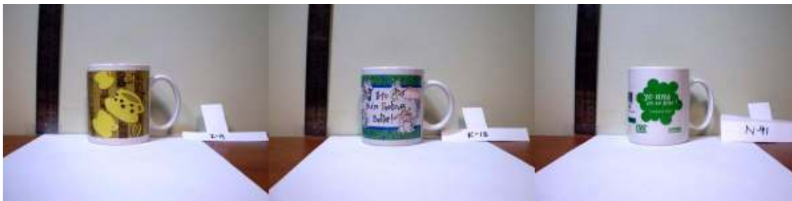
Figure 2: The cylindrical group artefacts I-19, K-13, and N-41 http://dollarware.org/i-19.jpg http://dollarware.org/k-13.jpg http://dollarware.org/n-41.jpg

The first cluster is the cylindrical. From this chart, we can see a large portion of the assemblage artefacts occurs within a cluster with the top-base ratio close to 1.0 and a height between 9-10 cm. This makes the cylindrical cluster a representative of the most common vessel, or a modal vessel. Three vessels were selected to form a cylindrical group: artefacts I-19, K-13, and N-41 (top-bottom ratio average is 1.01 and average height is 95.47mm) (see figure 2).